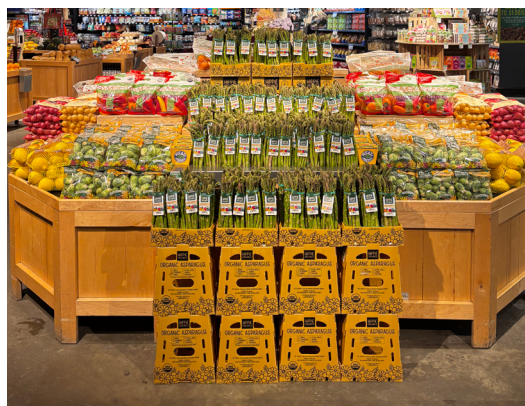
HEALTHY LIVING MARKET Burlington, VT