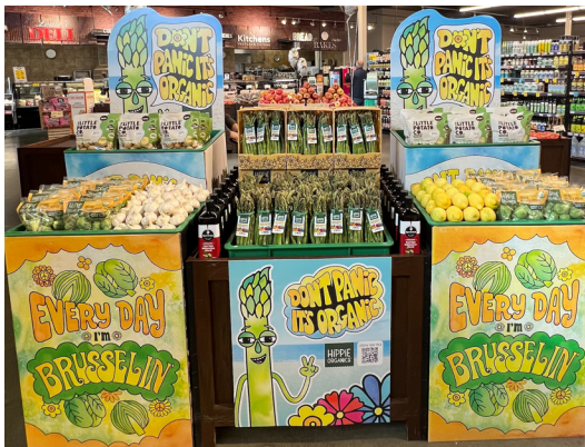
LEG UP FARMERS MARKET York, PA