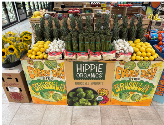
MILLER'S NATURAL FOODS Bird in Hand, PA