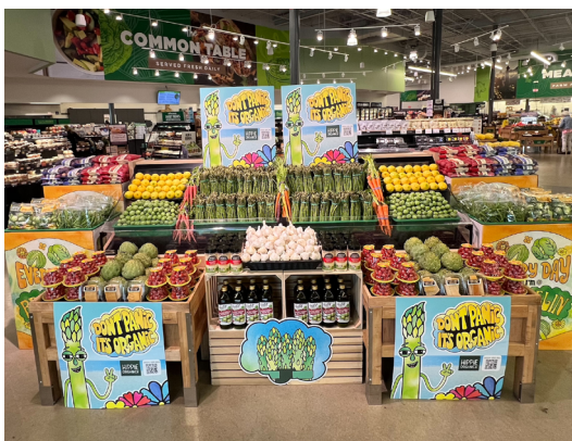
COMMON MARKET 7TH STREET Frederick, MD