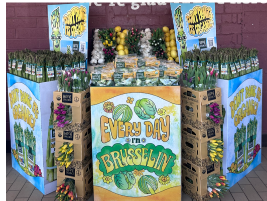
EAST AURORA COOPERATIVE MARKET East Aurora, NY