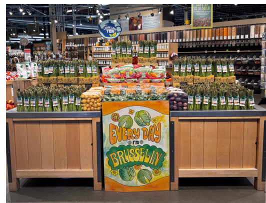
HEALTHY LIVING MARKET Saratoga Springs, NY