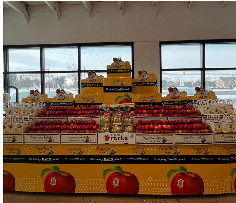
GREENSTAR FOOD COOP Ithaca, NY