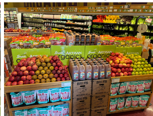
ROOTS MARKET Clarksville, MD