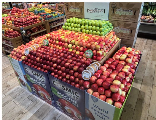
KIMBERTON WHOLE FOODS Collegeville, PA