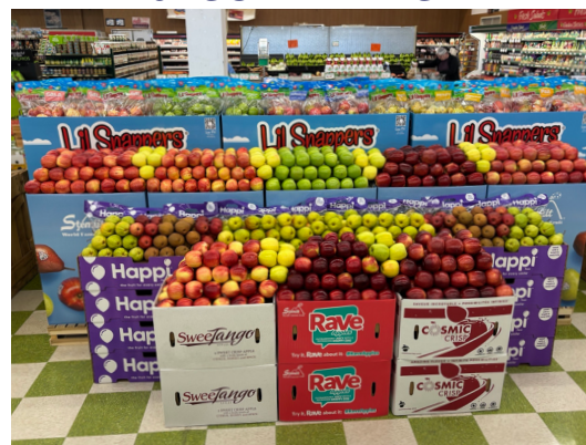
WEAVERS MARKET Adamstown, PA