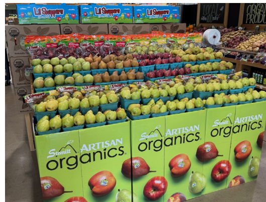
KIMBERTON WHOLE FOODS Wyomissing, PA