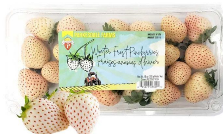
Code 234361 CV Pineberries 6/10 oz Clamshell