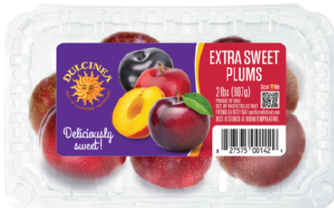
Code 243098 CV Plums Extra Sweet Import 10/2 lb Clamshell