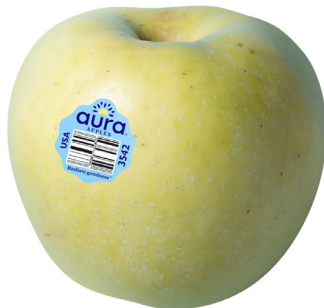
Code 234664 CV Apples Aura 27 lb Stemilt