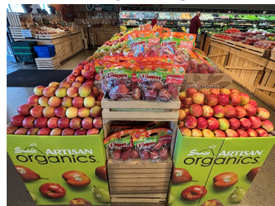
MOTHER EARTH STOREHOUSE Kingston, NY