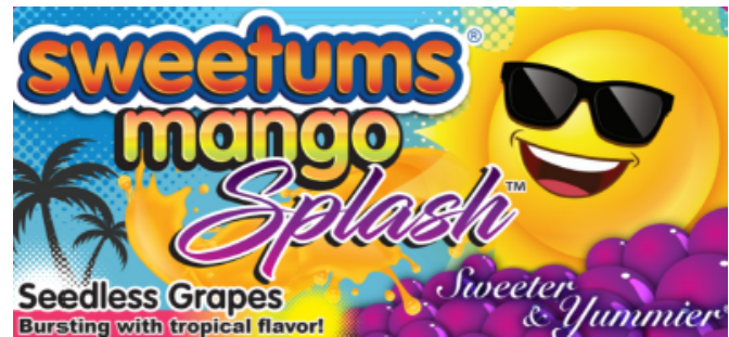
Code 228965 CV Grapes Mango Splash 10/1lb Clamshell