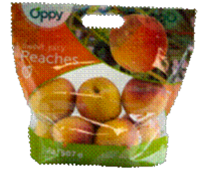
Code 15642 CV Peaches 10/2 lb Pouch Bag