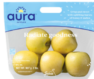
Code 238380 CV Apples Aura 12/2 lb Pouch