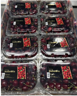
Code 239671 CV Cherries 16/1 lb Clamshell