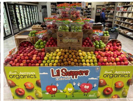
MILLER'S FOOD MARKET Manchester, MD