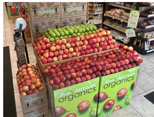
KIMBERTON WHOLE FOODS Douglasville, PA