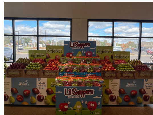
SOULBERRY NATURAL MARKET New Hope, PA