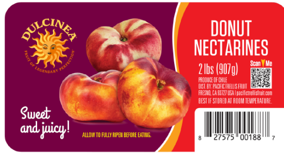
Code 247719 CV Nectarine Donut 10/2 lb Clamshell