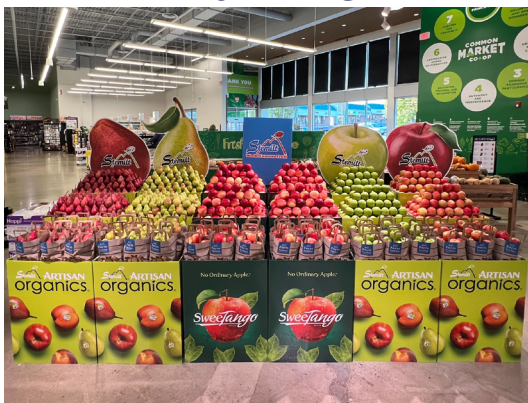
COMMON MARKET 7TH STREET Frederick, MD