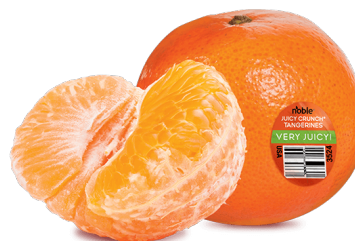
Code 216872 CV Tangerines Juicy Crunch FL 40 ct 80sz