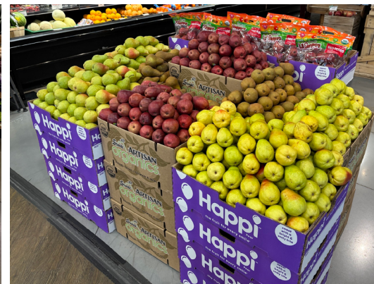
WEAVERS WAY CO-OP Ambler, PA