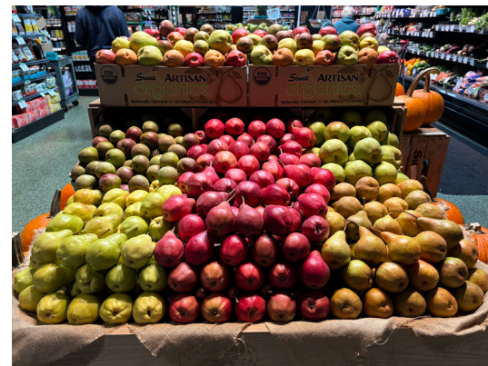
WEAVERS WAY CO-OP GERMANTOWN Philadelphia, PA