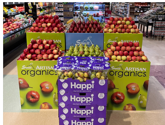
COMMON MARKET ROUTE 85 Frederick, MD