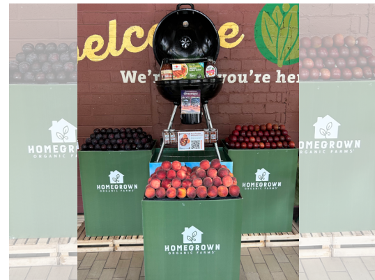
EAST AURORA CO-OP East Aurora, NY