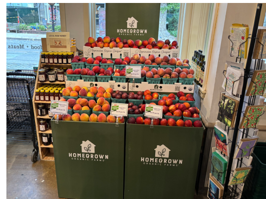
WEAVERS WAY CO-OP Philadelphia, PA