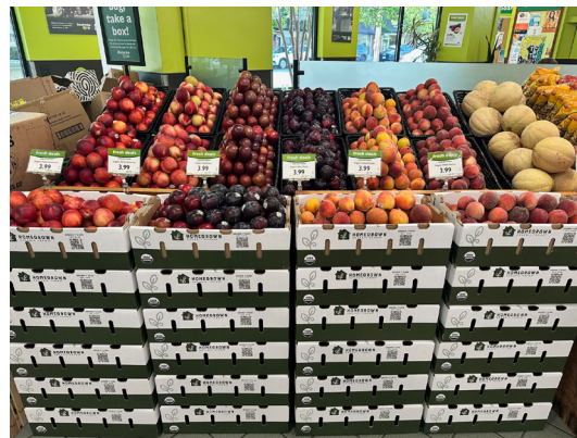
ROANOKE COOP Roanoke, VA