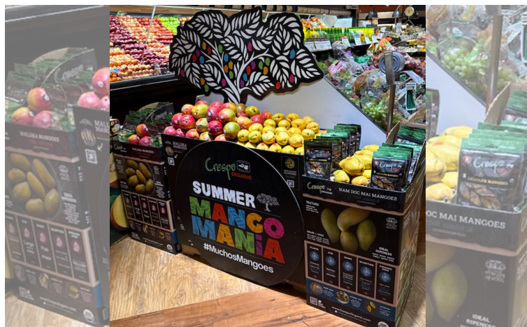
MCCAFFREY'S FOOD MARKET Newtown, PA