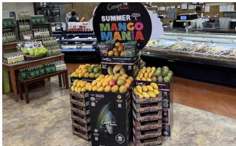
MCCAFFREY'S FOOD MARKET Yardley, PA