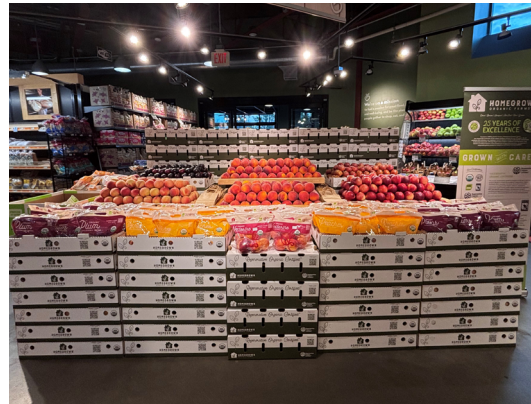
HEALTHY LIVING MARKET South Burlington, VT