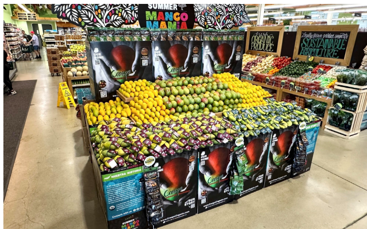
KIMBERTON WHOLE FOODS Wyomissing, PA