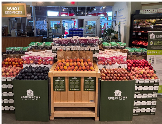
HEALTHY LIVING MARKET Saratoga Springs, NY