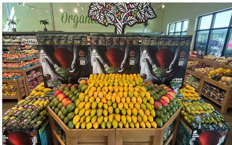
KIMBERTON WHOLE FOODS Ottsville, PA