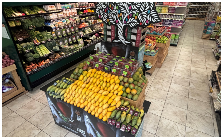
KIMBERTON WHOLE FOODS Douglasville, PA