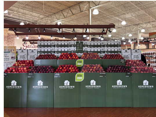
HENNING'S SUPERMARKET Harleysville, PA