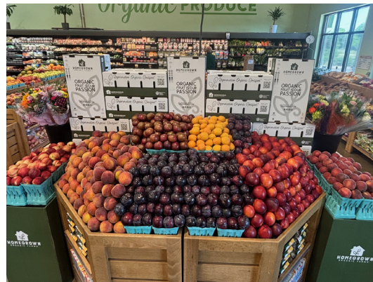
KIMBERTON WHOLE FOODS Ottsville, PA