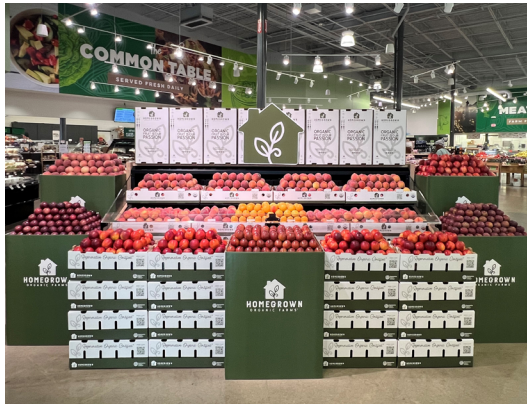
COMMON MARKET 7TH STREET Frederick, MD