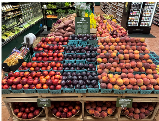
KIMBERTON WHOLE FOODS Phoenixville, PA