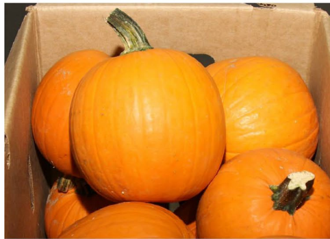
Code: 4950 BABY PAM (PIE) 12 ct case PLU: 3134