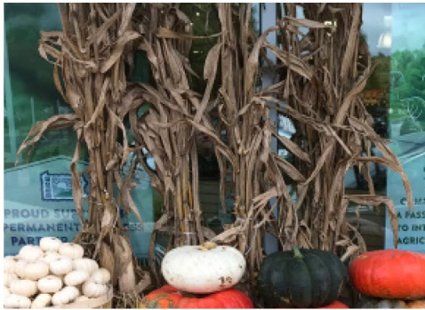
Code: 4945 CORN STALKS 1 bunch PLU: Retailer-Assigned