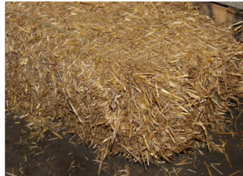
Code: 4935 REGULAR SIZE STRAW BALES 1 ct PLU: Retailer-Assigned