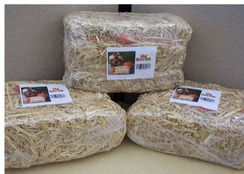
Code: 222242 MINI CELLO STRAW BALES 50 ct UPC: 21879-20080 *Pre-Order Survey Only*