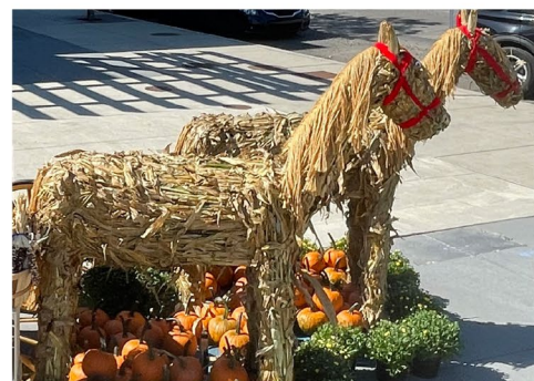
Code: 229043 CORN STALK HORSE *Pre-Order Survey Only*