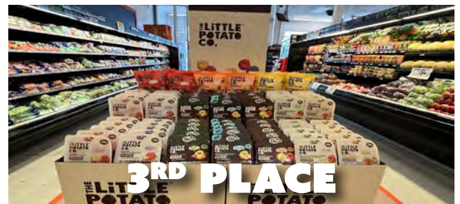
Foley's Family Market - Hamilton Township, NJ