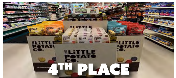
Frenchtown Market - Frenchtown, NJ