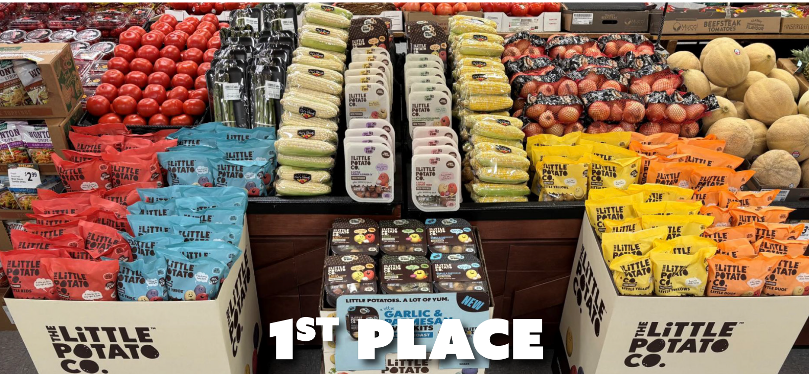
Saubel's Markets - Shrewsbury, PA