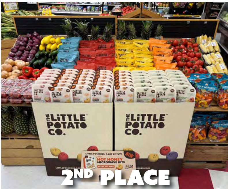
Trout's Jubilee Foods - Emmitsburg, MD