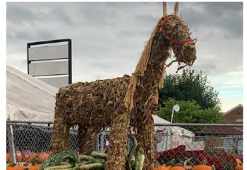
Code: 229043 CORN STALK HORSE *Available by request*