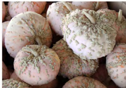
PEANUT PUMPKIN BIN