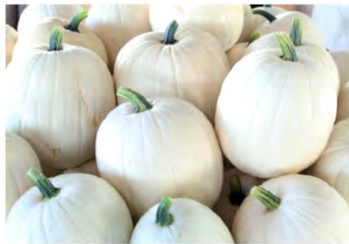
WHITE PUMPKIN BIN