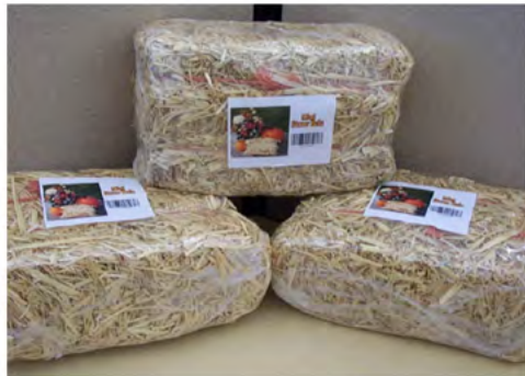
Code: 222242 MINI CELLO STRAW BALES 50 ct 21879-20080 *Pre-Order Survey Only*