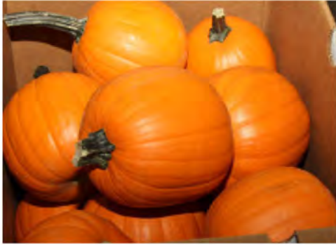
Code: 4950 BABY PAM (PIE) 12 ct case PLU: 3134