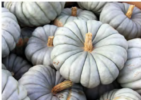
BLUE JARRAHDALE PUMPKIN BIN