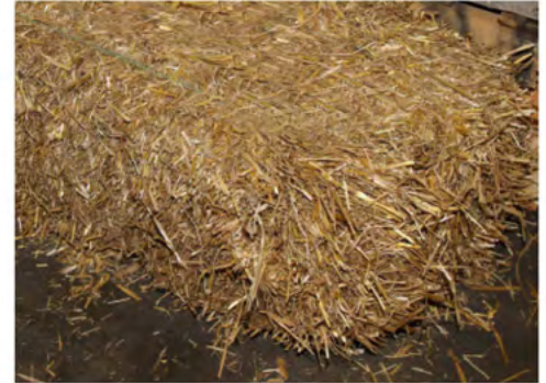
Code: 4935 REGULAR SIZE STRAW BALES 1 ct PLU: Retailer-Assigned