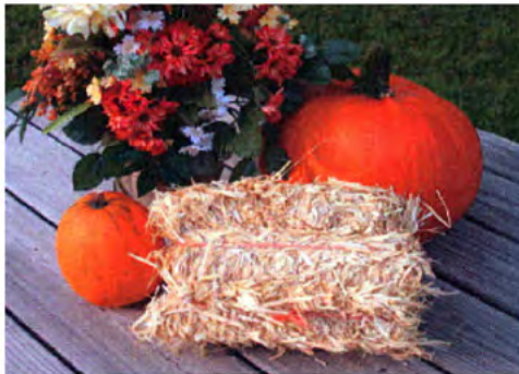
Code: 222243 SMALL SINGLE STRAW BALE 24 ct *Pre-Order Survey Only*