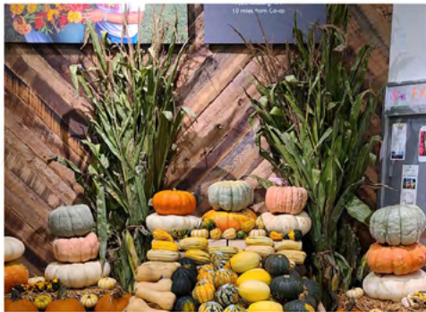
Code: 4945 CORN STALKS 1 bunch PLU: Retailer-Assigned