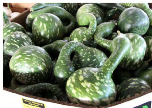
LONG NECK GREEN SQUASH BIN (Goose Gourds)