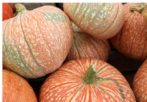
ONE TOO MANY PUMPKIN BIN