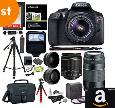
Camera Bundle + $50 Amazon card