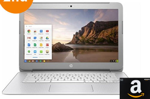
HP Chromebook + $50 Amazon card