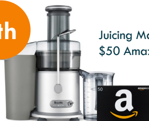
Juicing Machine + $50 Amazon card