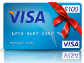
$100 Gift Card

**A MINIMUM OF 15 CASES OF NATURIBE ORGANIC BLUEBERRIES MUST BE PURCHASED FROM FOUR SEASONS PRODUCE TO BE ELIGIBLE FOR THE CONTEST**