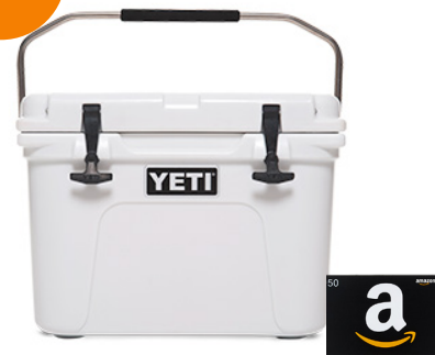
Yeti Cooler + $50 Amazon card