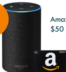
Amazon Echo + $50 Amazon card