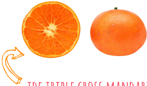
TDE TRIPLE CROSS MANDARIN