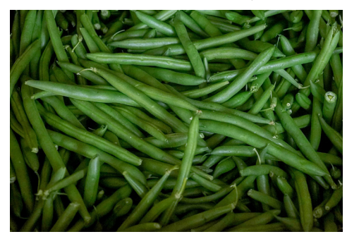
OG GREEN BEANS

Mexican Organic Green Beans quality will remain outstanding for Christmas at close to conventional pricing. Then, costs are expected to increase and return to normal levels for January.