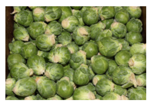
CV BRUSSELS SPROUTS

12ct Cello Cauliflower quality is beautiful and in good supply for Christmas. More limited availability is projected for early January.