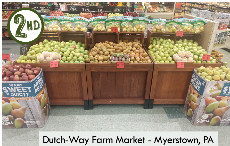
Dutch-Way Farm Market - Myerstown, PA