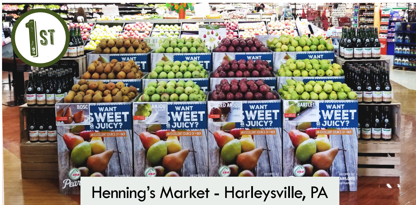
Henning's Market - Harleysville, PA

Four Seasons Produce “peared” up with the Northwest Pear Bureau to bring you a display contest for the month of November! What a pear-fect time of year to promote and drive sales in the pear category.