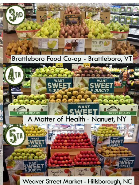
Brattleboro Food Co-op - Brattleboro, VT