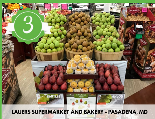
LAUERS SUPERMARKET AND BAKERY - PASADENA, MD