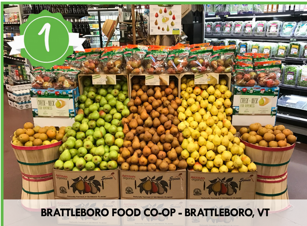
BRATTLEBORO FOOD CO-OP - BRATTLEBORO, VT

Four Seasons Produce “peared” up with USA Pears to bring you the this display contest from November 5th to December 3rd. We had 50 entries with fantastic displays! Thank you to everyone who participated in this event.