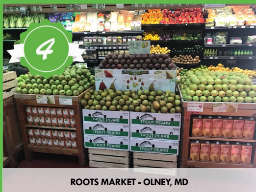
ROOTS MARKET - OLNEY, MD