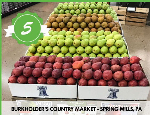
BURKHOLDER'S COUNTRY MARKET - SPRING MILLS, PA

CLICK HERE TO VIEW ALL OF THE SUBMISSIONS!