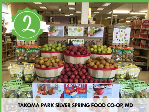
TAKOMA PARK SILVER SPRING FOOD CO-OP, MD