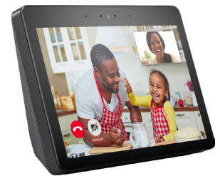
Amazon Echo Show

Every entry will receive a Vintage Sweets hat just for entering!