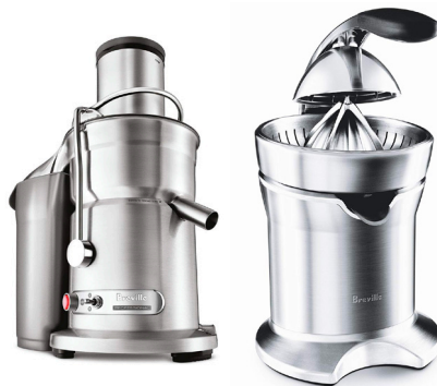
Breville Juicing Machine