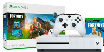
Xbox One S Console Bundle