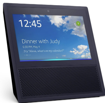
Amazon Echo Show