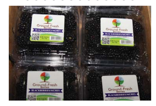
CV BLACKBERRIES & RASPBERRIES

While Blueberry production out of Argentina is on the decline, Chilean numbers are on the way up. Prices will continue to adjust down slightly as overall volumes increase.