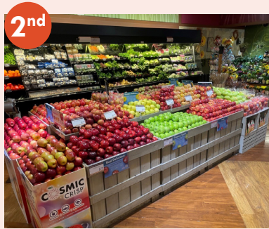
MCCAFFREY'S FOOD MARKET Newtown, PA