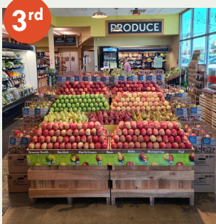
FRIENDLY CITY FOOD CO-OP Harrisonburg, VA