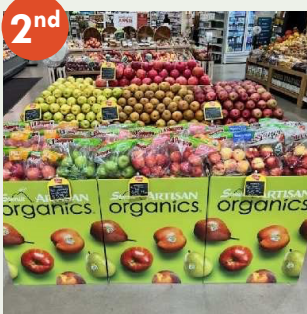
KIMBERTON WHOLE FOODS Wyomissing, PA