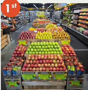
BERKSHIRE FOOD CO-OP Great Barrington, MA