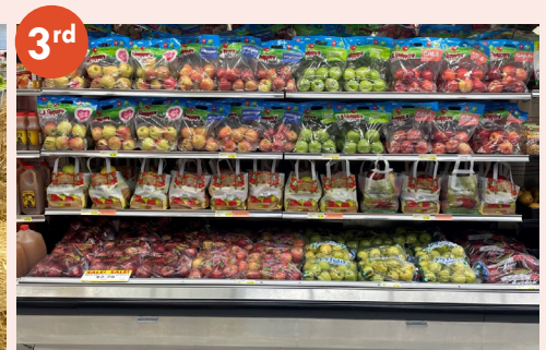
JUBILEE FOODS Emmitsburg, MD