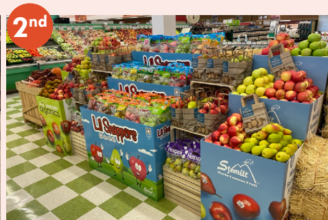
WEAVER MARKETS Denver, PA