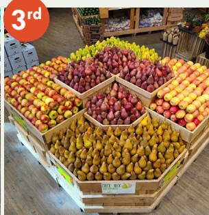
MONADNOCK FOOD CO-OP Keene, NH