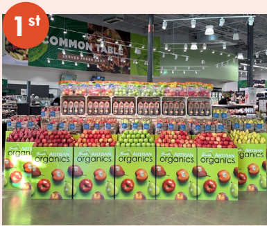
COMMON MARKET 7TH ST Frederick, MD