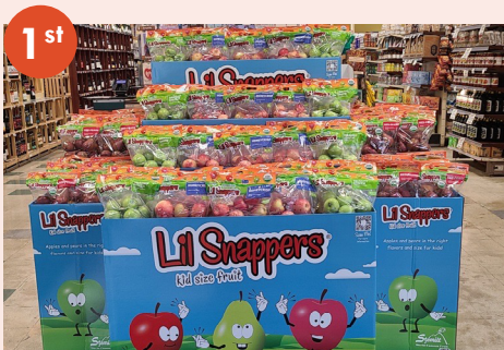
TAKOMA PARK FOOD CO-OP Takoma Park, MD