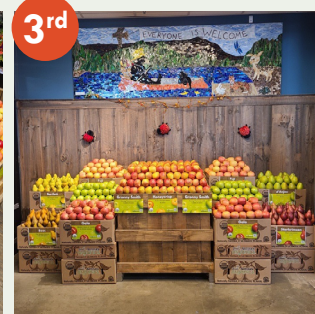
RIVER VALLEY CO-OP Easthampton, MA