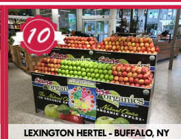
LEXINGTON HERTEL - BUFFALO, NY