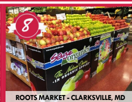
ROOTS MARKET - CLARKSVILLE, MD