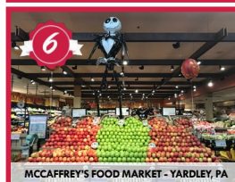
MCCAFFREY'S FOOD MARKET - YARDLEY, PA