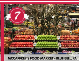
MCCAFFREY'S FOOD MARKET - BLUE BELL, PA