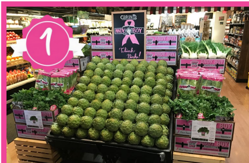
CARAVIA FRESH FOODS - SOUTH ABINGTON TOWNSHIP, PA

Four Seasons Produce partnered with D'Arrigo CA to bring you the second annual Andy Boy Display Contest! October was Breast Cancer Awareness Month, and what better month to raise awareness by promoting the D'Arrigo line of fresh vegetables with the pink ribbon on each package!