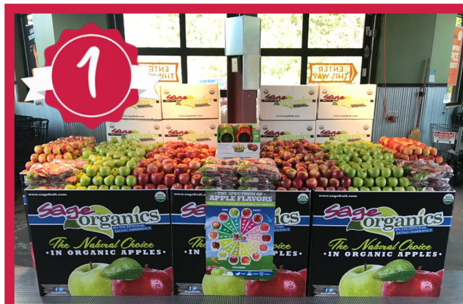
HEALTHY LIVING - BURLINGTON, VT

Four Seasons Produce partnered with Washington Sage Organics to bring you the this display contest from October 1st to November 4th. We had over 60 entries with fantastic displays! Thank you to everyone who helped participate in this event.