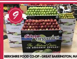
BERKSHIRE FOOD CO-OP - GREAT BARRINGTON, MA