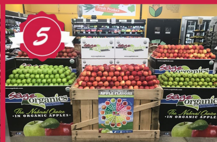
ABUNDANCE CO-OP - ROCHESTER, NY