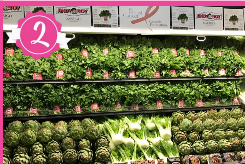
HONEST WEIGHT FOOD COOP - ALBANY, NY