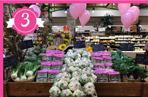
DRESHERTOWN - DRESHER, PA