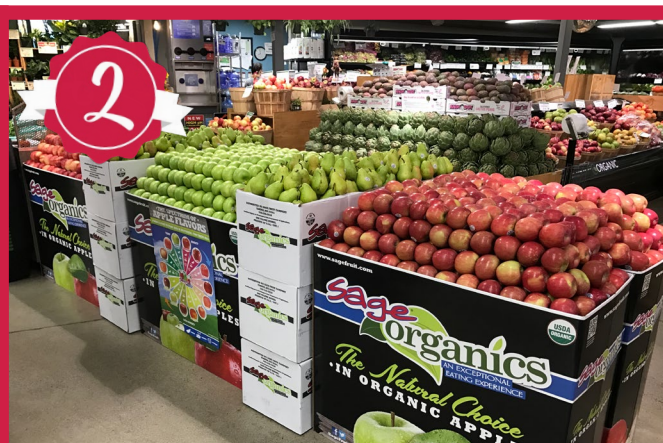
RIVER VALLEY CO-OP, NORTHAMPTON, MA