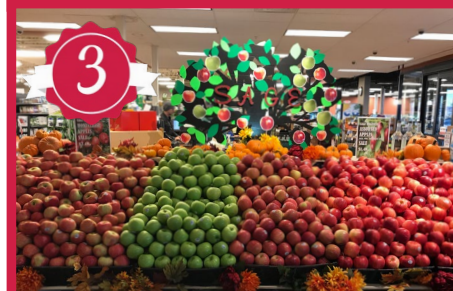
MOTHER EARTH - KINGSTON, NY