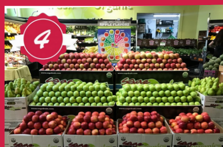
MONADNOCK FOOD CO-OP - KEENE, NH