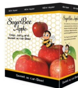
CODE: 223135 POS Display Pop Up Bin #1