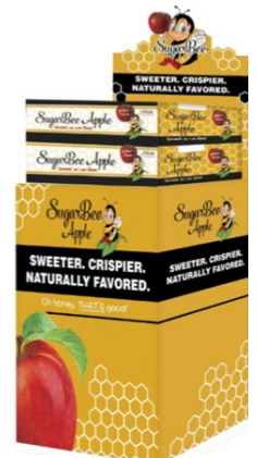
CODE: 226286 POS Display Pop Up Bin #2

So it's time to start dreaming up your next display contest winner! “Bee” creative, have fun, and use this promotion to introduce your customers to the incredible SugarBee apple!