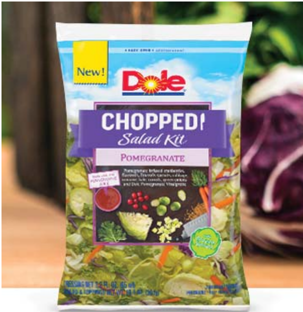
03511 - CV Dole Chop Pomegranate 6/13.1 oz.