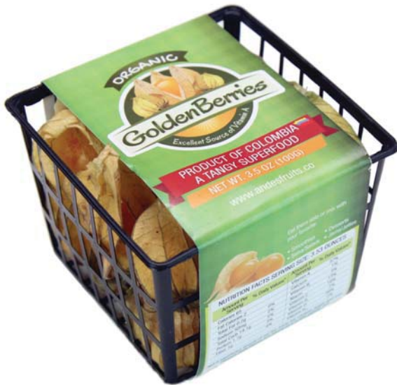
42182 - OG Golden Berries w/Husk 12/1pt