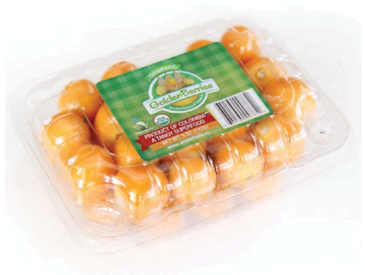
42181 - OG Golden Berries Peeled 12/5oz