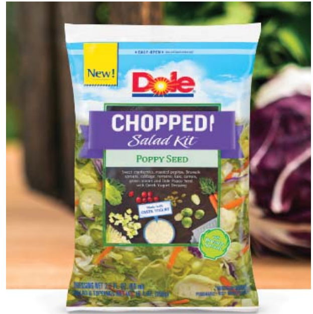
03512 - CV Dole Chop Poppyseed 6/13 oz.