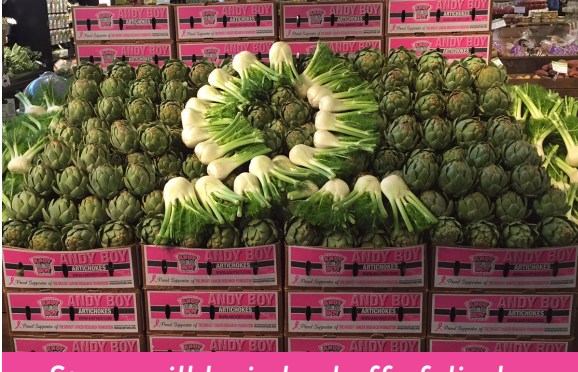
Stores will be judged off of display creativity and overall eye appeal.

http://www.andyboy.com/social-responsibility/growing-for-prevention/