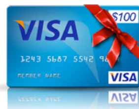
$100 Gift Card

**A MINIMUM OF 15 CASES OF NATURIPE ORGANIC BLUEBERRIES MUST BE PURCHASED FROM FOUR SEASONS PRODUCE TO BE ELIGIBLE FOR THE CONTEST**