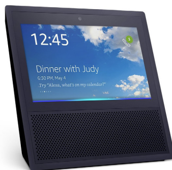
Amazon Echo Show