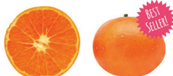
TDE TRIPLE CROSS MANDARIN

Buck Brand Organic TDE Tangerines are in peak season. This specialty variety is a triple cross between a Temple tango, a Dancy mandarin, and an Encore mandarin. Fruit is very flavorful and virtually seedless.