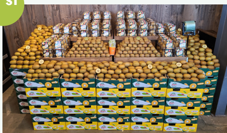
River Valley Co-op Easthampton, MA