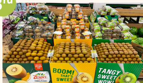
Weaver Markets Denver, PA