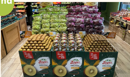
Kimberton Whole Foods Collegeville, PA