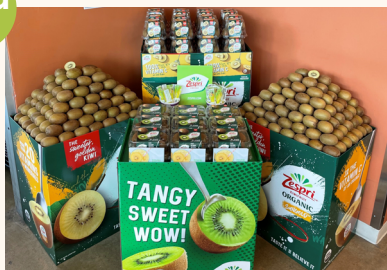
Friendly City Food Co-op Harrisonburg, VA