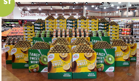
Hennings Market Harleysville, PA