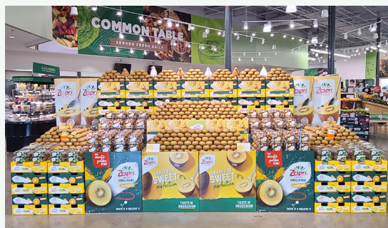
The Common Market 7th St. Frederick, MD