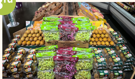
Dawson's Market Rockville, MD