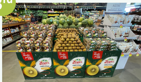
A Matter of Health Nanuet, NY