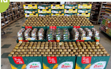
Takoma Park Food Co-op Takoma Park, MD