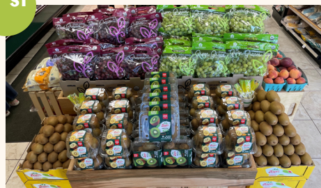
Kimberton Whole Foods Douglasville, PA