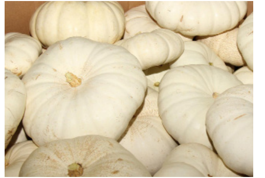
WHITE FLAT PUMPKIN BIN