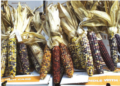
Code: 4901 INDIAN CORN 16/3 ct case UPC: 033383-40077