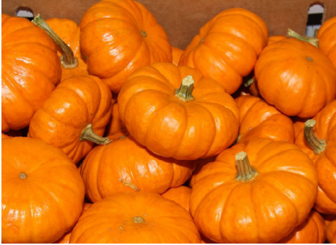
Code: 4822 JACK-BE-LITTLE (MINI-PUMPKINS) 40 ct case PLU: 4734