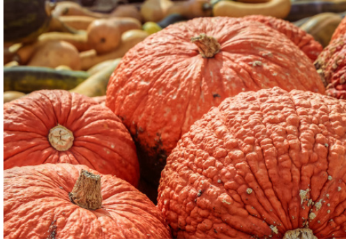
RED WARTY THING BIN