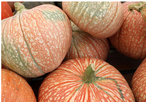
ONE TOO MANY PUMPKIN BIN