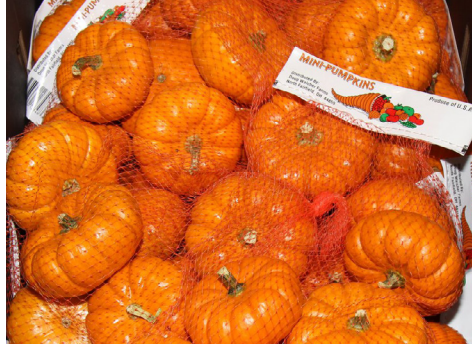
Code: 4929 JACK-BE-LITTLES BAGGED 14/5 ct case UPC: 743425-08950