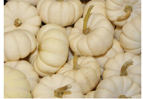
Code: 214521 WHITE JACK-BE-LITTLES (BABY BOO) 40 ct case PLU: 4734