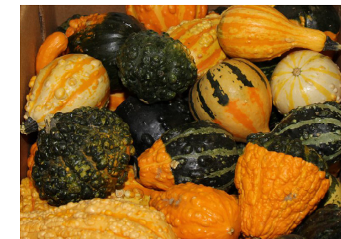
Code: 4930 GOURDS 40 ct case PLU: 3135