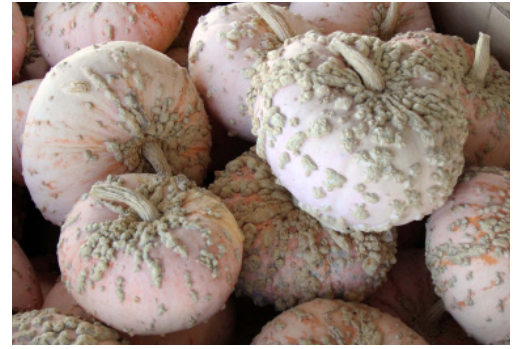
PEANUT PUMPKIN BIN