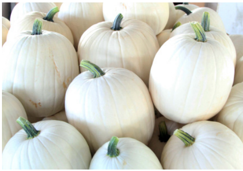
WHITE PUMPKIN BIN