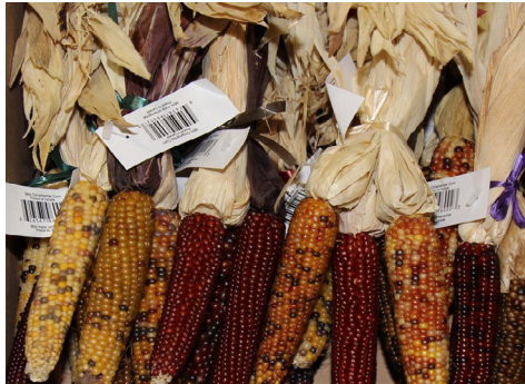
Code: 214039 MINI INDIAN CORN Display box 16/3 ct case UPC: 743425-40076