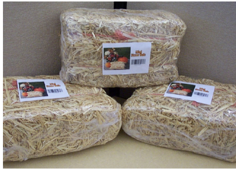
Code: 222242 MINI CELLO STRAW BALES 50 ct 21879-20080 *Pre-Order Survey Only*