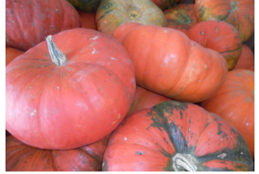
CINDERELLA PUMPKIN BIN