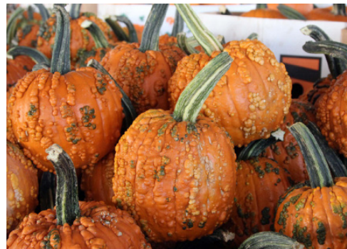
WARTY GOBLIN / KNUCKLEHEAD PUMPKIN BIN