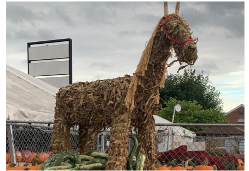
Code: 229043 CORN STALK HORSE *Available by request*