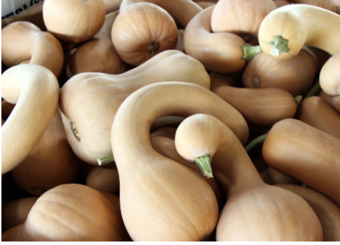
NECK PUMPKIN BIN