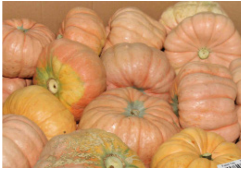
PINK PORCELAIN PUMPKIN BIN