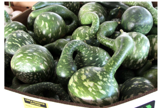
LONG NECK GREEN SQUASH BIN (Goose Gourds)