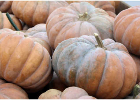
FAIRYTALE PUMPKIN BIN