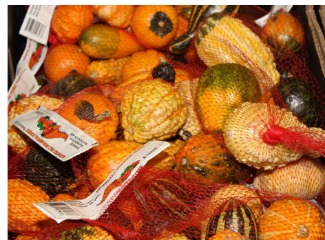
Code: 232524 GOURDS BAGGED 12/6 ct case UPC: 7-46309-12347-6