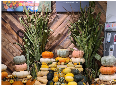
Code: 4945 CORN STALKS 1 bunch PLU: Retailer-Assigned