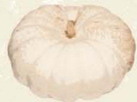
Flat White Boer