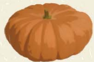
Long Island Cheese