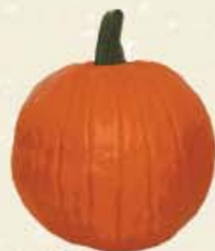
Face Pumpkin/ Jack-o-Lantern