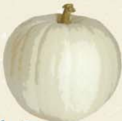
Valenciano White Face

These decorative pumpkins are best for drawing, carving and painting.