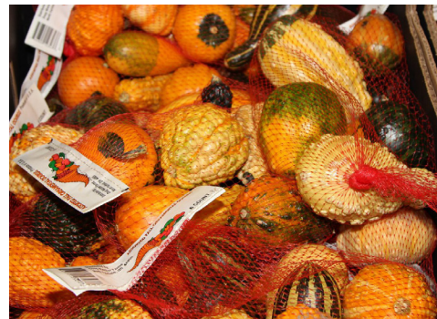
04928 GOURDS BAGGED 145 ct case UPC: 743425-09321