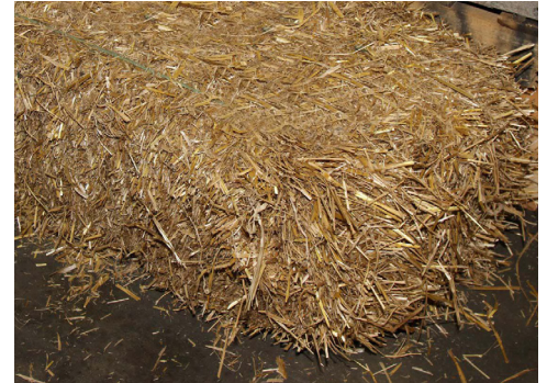
04935 REGULAR SIZE STRAW BALES 1 ct