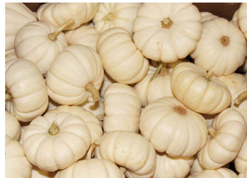
04823 WHITE JACK-BE-LITTLES (BABY BOO) 50 ct case