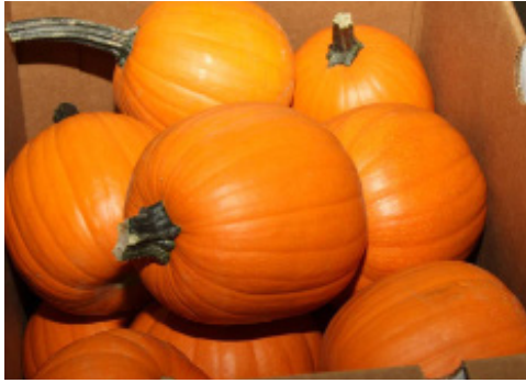
04950 BABY PAM (PIE) 12 ct case