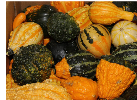
04930 GOURDS 40 ct case