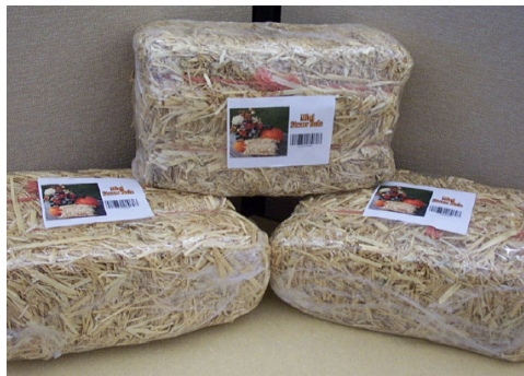
04931 MINI CELLO STRAW BALES 50 ct 21879-20080 *Pre-Order Survey Only*