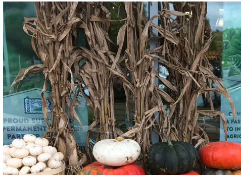
04945 CORN STALKS 1 bunch