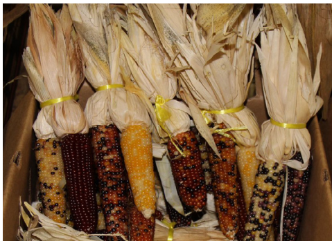
214039 MINI INDIAN CORN Display box 16/3 ct case UPC: 743425-40076