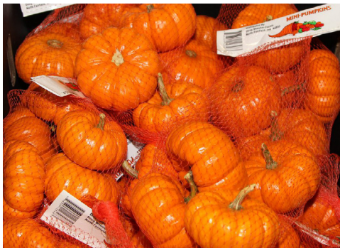
04929 JACK-BE-LITTLES BAGGED 14/5 ct case UPC: 743425-08950