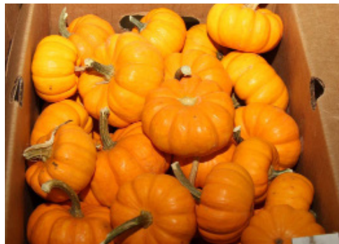
04822 JACK-BE-LITTLE (MINI-PUMPKINS) 40 ct case