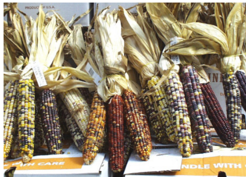
04901 INDIAN CORN 16/3 ct case UPC: 033383-40077