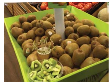
GREEN LIFE MARKET