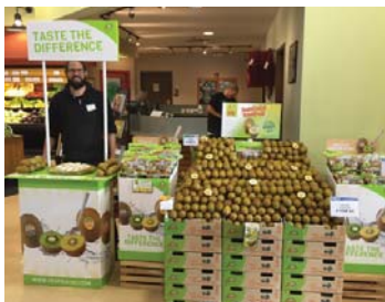
COMMON MARKET CO-OP