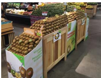
RIVER VALLEY MARKET CO-OP