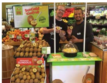
*ROOTS MARKET CLARKSVILLE