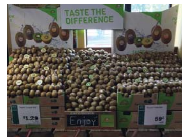
YES! ORGANIC MARKET GEORGIA AVE

*WINNER OF THE SAMPLING PROMO: ROOTS CLARKSVILLE