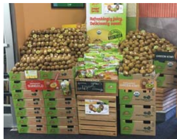
EAST END CO-OP