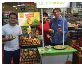
ROOTS MARKET OLNEY