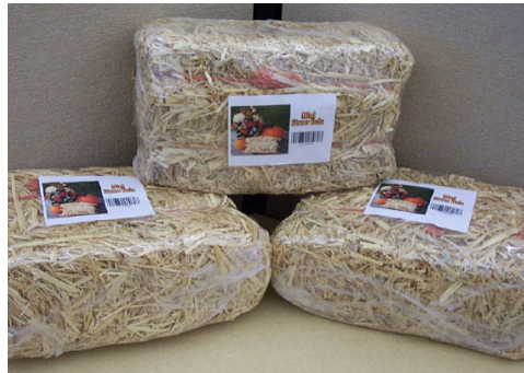
Code: 222242 MINI CELLO STRAW BALES 50 ct 21879-20080 *Pre-Order Survey Only*