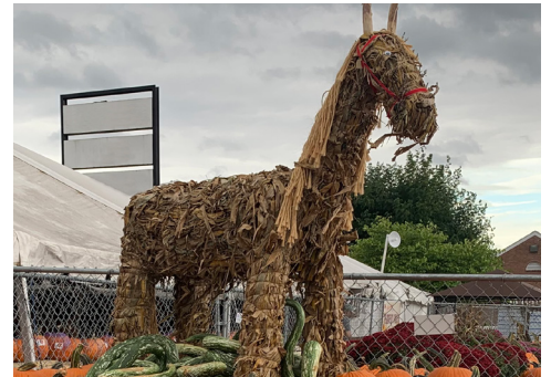
Code: 229043 CORN STALK HORSE *Available by request*