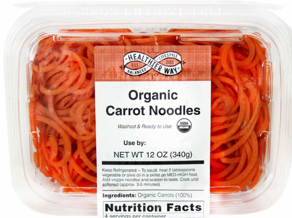
45693 - ORGANIC CARROT NOODLES 6/12oz UPC: 8 60892 00033 1