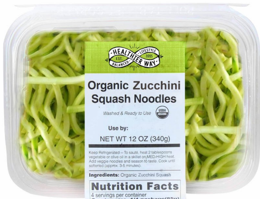
45704 - ORGANIC ZUCCHINI SQUASH NOODLES 6/12oz UPC: 8 60892 00038 6