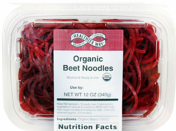
45692 - ORGANIC BEET NOODLES 6/12oz UPC: 8 60892 00034 8