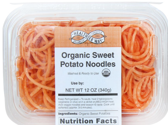
45695 - ORGANIC SWEET POTATO NOODLES 6/12oz UPC: 8 60892 00036 2