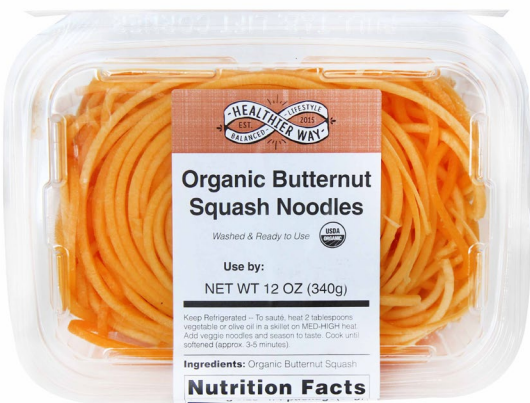
45694 - ORGANIC BUTTERNUT SQUASH NOODLES 6/12oz UPC: 8 60892 00035 5