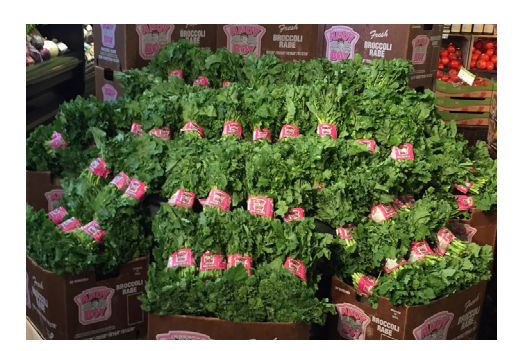
CV BROCCOLI RABE

It's still time to promote Broccoli Rabe ! Take advantage of an awesome price and exceptional quality on Andy Boy label Broccoli Rabe for another week.