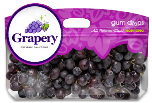
THE GRAPERY GUM DROPS GRAPES CODE: 225809