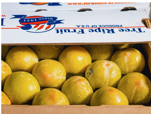
KING MIDAS YELLOW PLUMS CODE: 231835