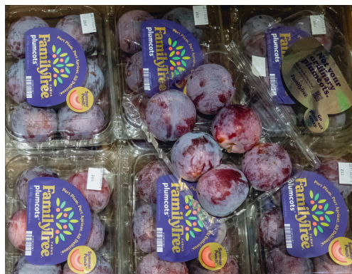
SUMMER PUNCH PLUMCOTS CODE: 233351