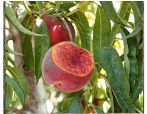
CHERRY ROSE RED FLESH PEACHES CODE: 236583