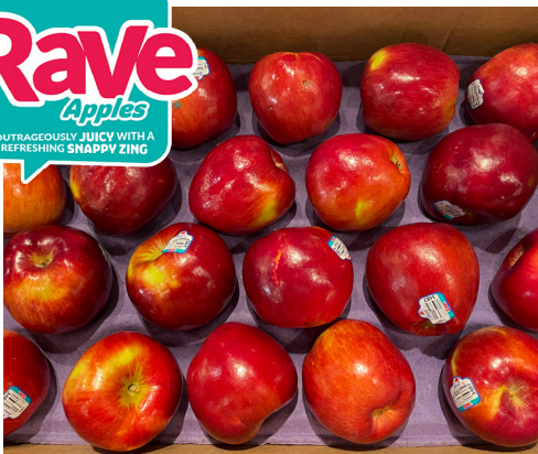
STEMILT RAVE APPLES CODE: 221612