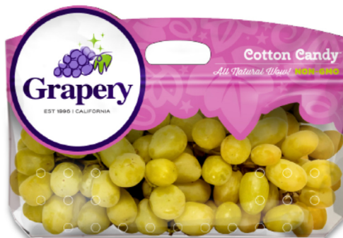
THE GRAPERY COTTON CANDY GRAPES CODE: 10570