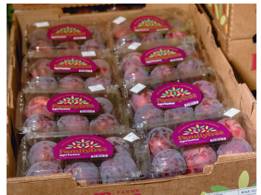
MIDNIGHT ROSE APRIUMS CODE: 236291