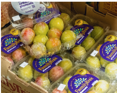
FLAVOR GRENADE PLUMCOTS CODE: 233326