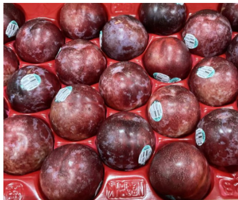
RED RASPBERRY PLUOTS CODE: 236684