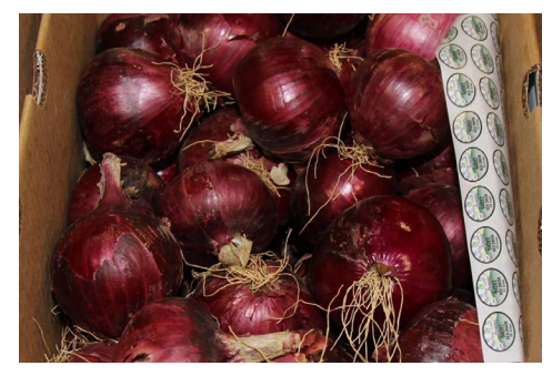
OG POTATOES/ONIONS/SWEETS Local PA Organic Red and Sweet Onions remain in good supply this week and are two very good items to promote at the moment. Organic Yellow Onions are in abundant supply out of California.

Look for product from Ohio and New York to supplement, however supplies will be limited from those growing regions as well.