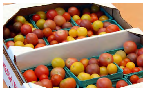
Cedar Meadow Tomatoes in Season July-August

The roots also create healthy soil that’s resistant to run-off during rain, protecting the surrounding water shed and providing immensely better water far down-stream. This is all done in place of traditional tilling, which simply turns the soil over with no added or long-term benefit. No-till farming is much more work, but the long-term benefit is enormous. After 30+ years of cover-cropping, the fields planted help grow better, more nutrient-rich plants.