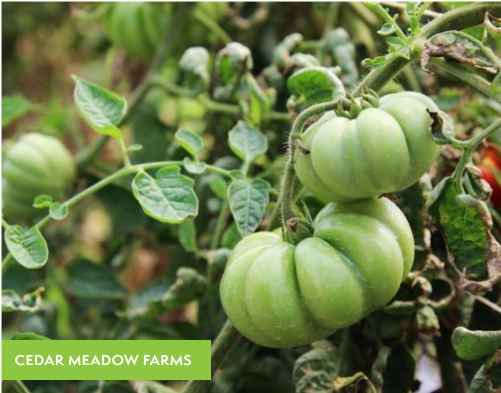
CEDAR MEADOW FARMS