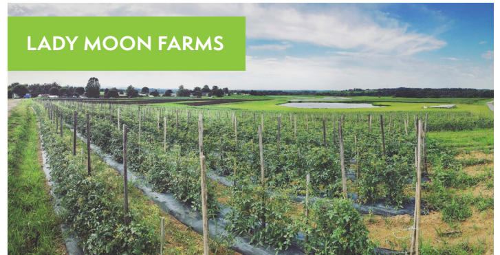
LADY MOON FARMS