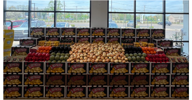
SOULBERRY NATURAL MARKET New Hope, PA