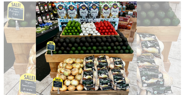
KIMBERTON WHOLE FOODS Douglasville, GA