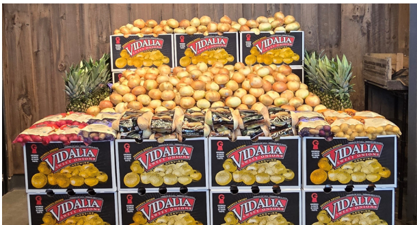
RIVER VALLEY CO-OP Easthampton, MA