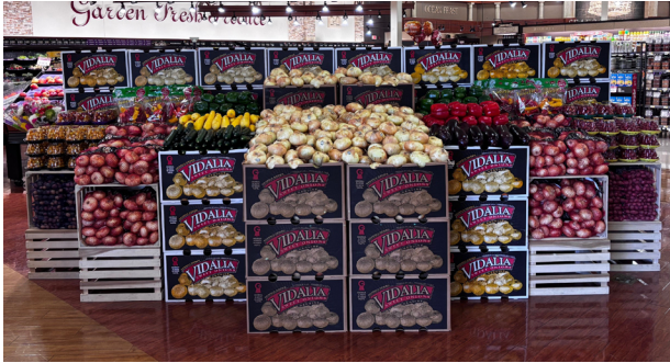
HENNING'S SUPERMARKET Harleysville, PA