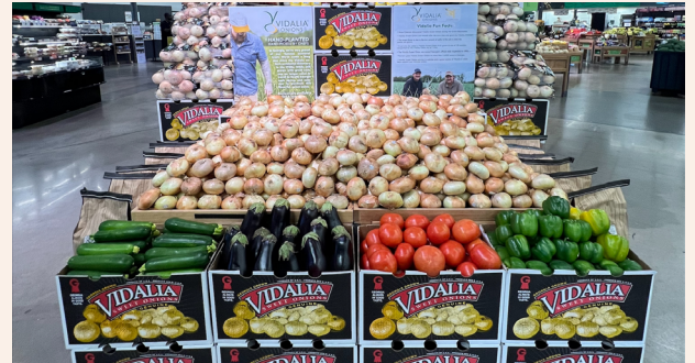
COMMON MARKET 7TH STREET Frederick, MD