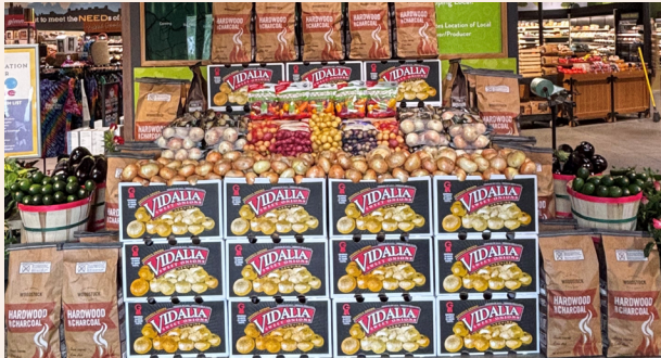
GREENSTAR FOOD COOP Ithaca, NY