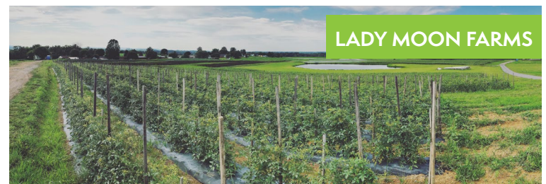
LADY MOON FARMS