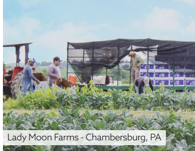
Lady Moon Farms - Chambersburg, PA

The 2020 spring local veg season is peaking later some years, but now that we are in mid-June many regional farms are hitting peak production on Organic Lettuces, Greens, Cabbages , and other row crops.