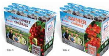
220570 Red/Rainier Stemilt Cherry Display Bin

**While use of social media is not required it is strongly recommended, as it is a great way to bring cherry awareness to your customers and get creative with advertising!