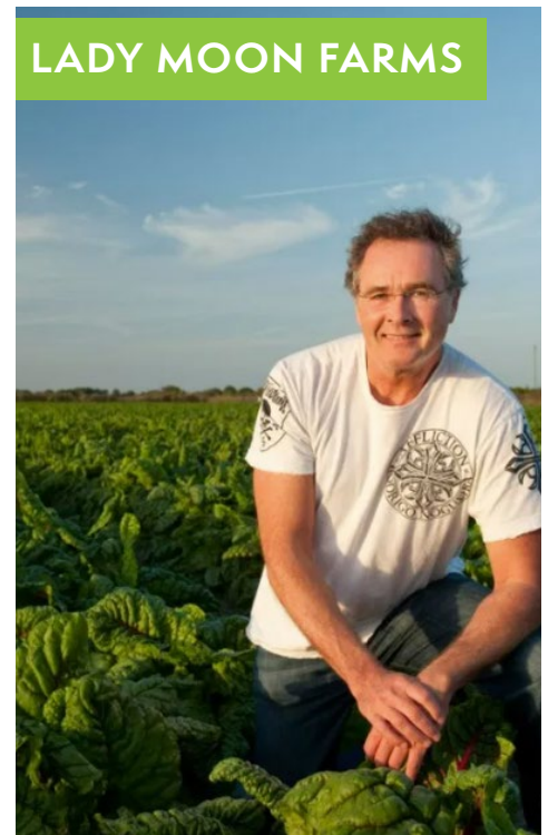
LADY MOON FARMS