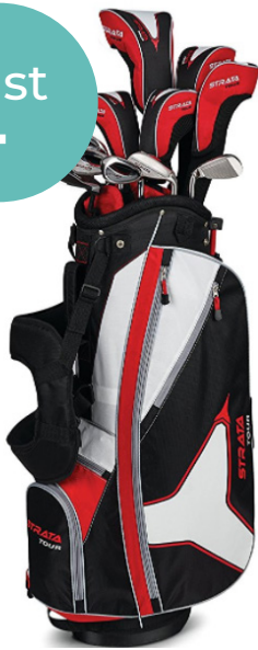
CALLAWAY GOLF CLUBS SET