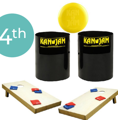
LAWN GAMES PACKAGE