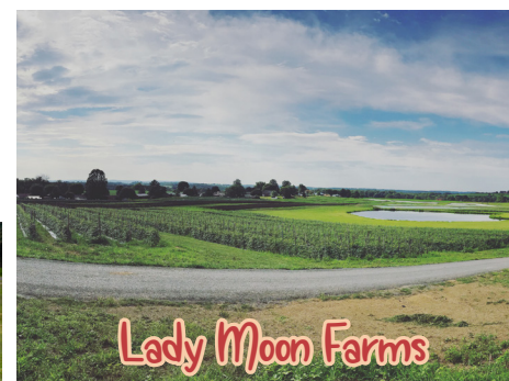
Lady Moon Farms