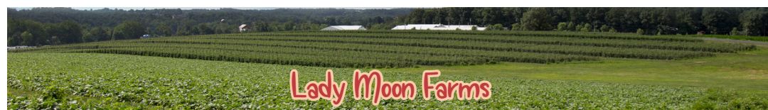
Lady Moon Farms