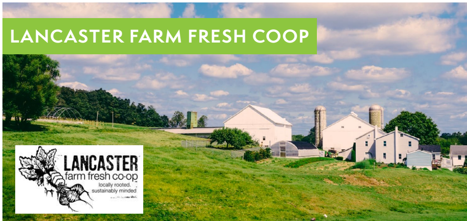
LANCASTER FARM FRESH COOP