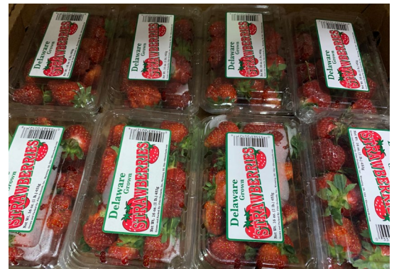
FIFER ORCHARDS - DE