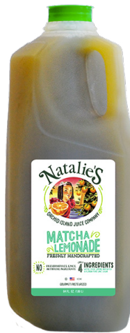
206715 CV Juice Lemonade Tea Matcha 6/64 oz Natalie's Juice 206719 CV Juice Lemonade Tea Matcha 6/16 oz Natalie's Juice 206723 CV Juice Lemonade Tea Matcha 25/8 oz Natalie's Juice