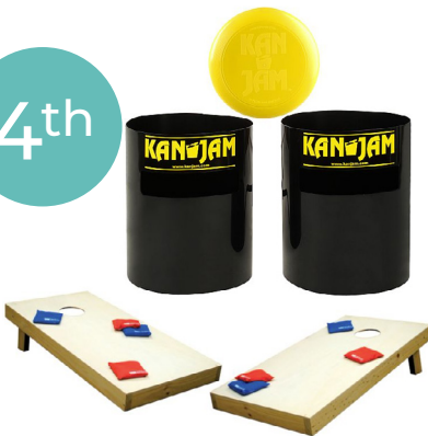
LAWN GAMES PACKAGE