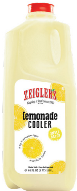
LEMONADE CODE: 6275 SIZE: 9/64 OZ