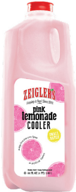
PINK LEMONADE CODE: 6270 SIZE: 9/64 OZ