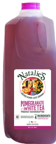
206714 CV Juice Tea Green Peach 6/64 oz Natalie's Juice 206718 CV Juice Tea Green Peach 6/16 oz Natalie's Juice 206722 CV Juice Tea Green Peach 25/8 oz Natalie's Juice 206713 CV Juice Tea Pomegranate White 6/64 oz Natalie's Juice 206717 CV Juice Tea Pomegranate White 6/16 oz Natalie's Juice 206721 CV Juice Tea Pomegranate White 25/8 oz Natalie's Juice