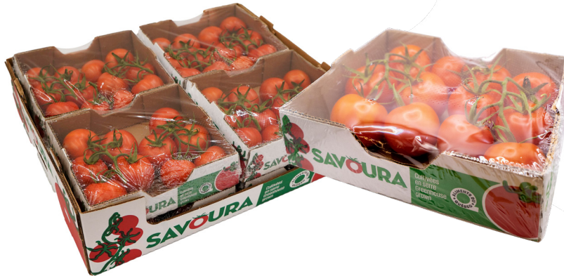
229867 - CV Tomatoes Cluster 8/4 lb Savoura Family-Pack box UPC: 8 11594 00037 2