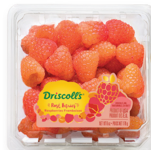
Rosé Berries™ Raspberry 6 oz Clamshell