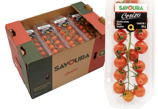
235655 - CV Tomatoes Cherry On-the-Vine "Cerizo" 20/5.3 oz Savoura clamshell UPC: 8 11594 10115 4