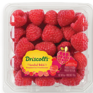
Sweetest Batch™ Raspberry 6 oz Clamshell