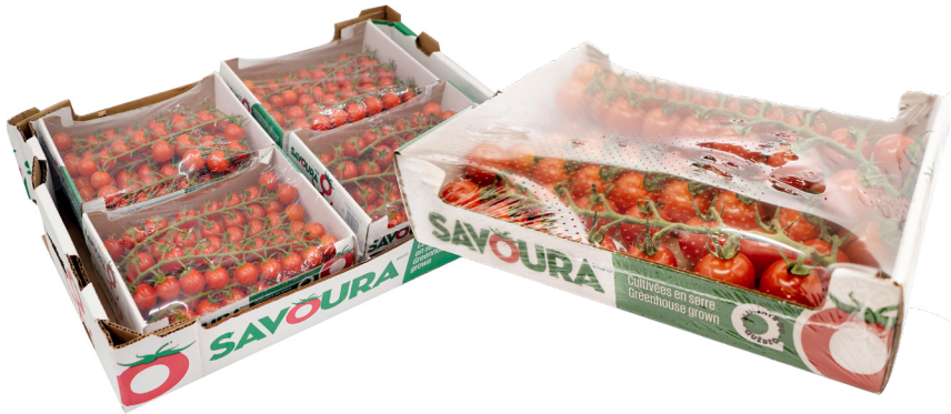
231339 - CV Tomatoes Cherry On-the-Vine "Cerizo" 8/1.5 lb Savoura Family-Pack box UPC: 8 11594 00004 4