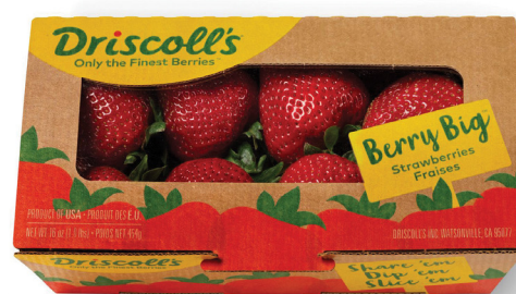
Berry Big Strawberries 16 oz Clamshell