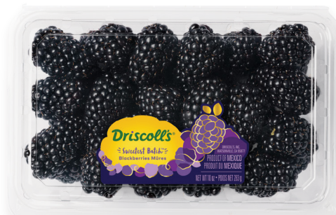
Sweetest Batch™ Blackberry 10 oz Clamshell