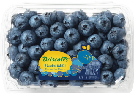
Sweetest Batch™ Blueberry 11 oz Clamshell