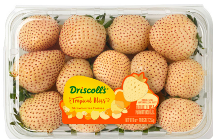
Tropical Bliss 9oz Clamshell