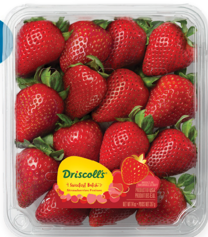
Sweetest Batch™ Strawberry 14 oz Clamshell