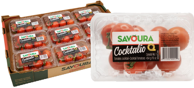
235654 - CV Tomatoes Cocktail On-the-Vine "Cocktalio" 9/1 lb Savoura clamshell UPC: 8 11594 10115 4