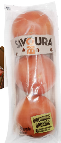
227745 - OG Tomatoes Beefsteak 12/1 lb Savoura Bio Tray Pack UPC: 8 59812 00018 6