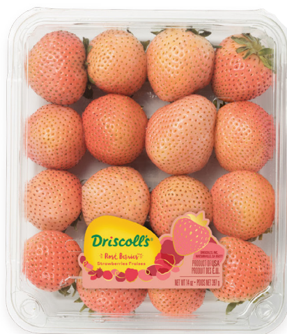
Rosé Berries™ Strawberry 14 oz Clamshell