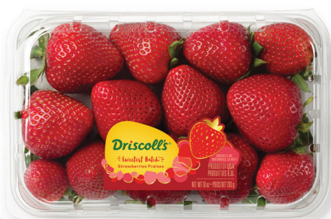
Sweetest Batch™ Strawberry 10 oz Clamshell

AVAILABLE AT FOUR SEASONS - LATE SPRING & EARLY SUMMER