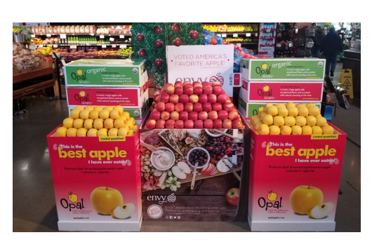
5TH PLACE: Honest Weight Coop - Albany, NY