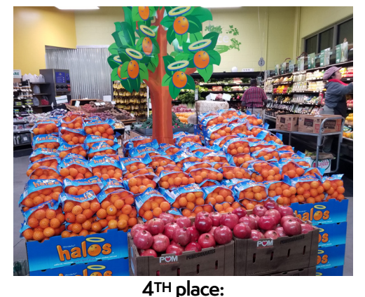
Durham Coop - Durham, NC