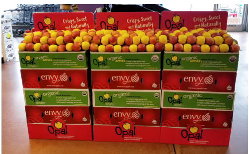
3RD PLACE: Weaver Street Southern Village - Chapel Hill, NC