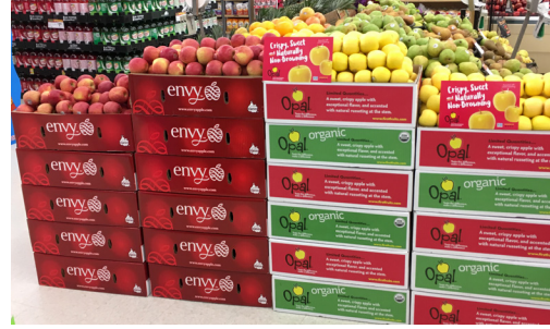
4<sup>TH</sup> PLACE: Yoder's Country Market - New Holland, PA