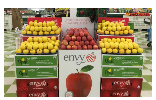
5TH PLACE: Weavers Market - Denver, PA