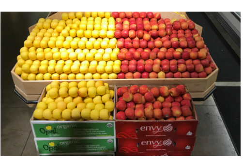
6TH PLACE: Dawson's Market - Rockville, MD