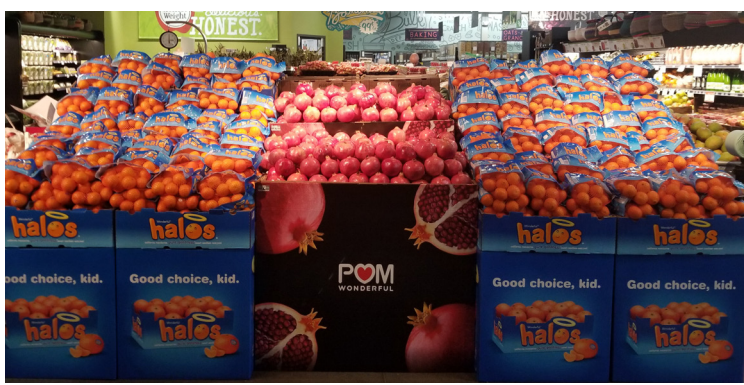
3RD place: Honest Weight Coop - Albany, NY