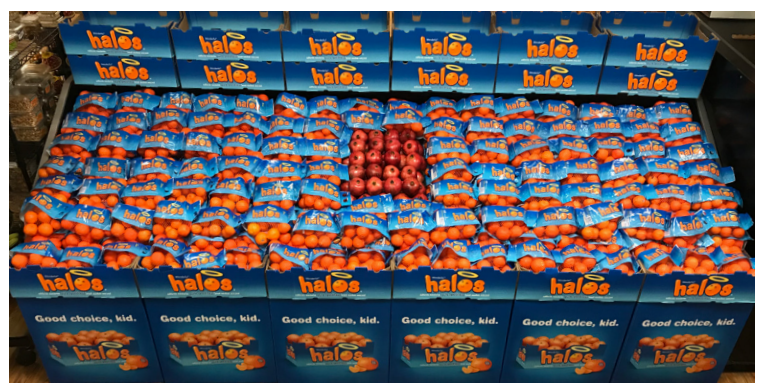
2ND place: The Butcher Shoppe - Chambersburg, PA