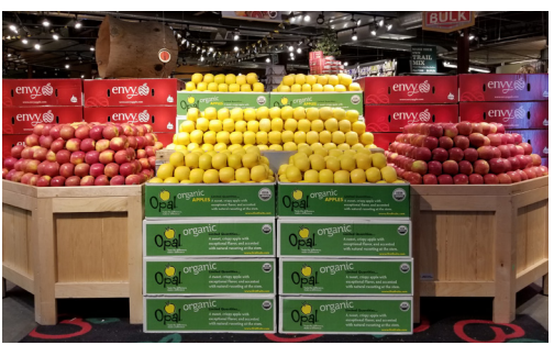
3RD PLACE: Healthy Living Market - South Burlington, VT