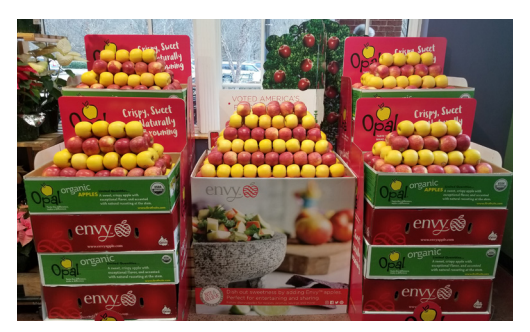
2ND PLACE: Weaver Street Hillsborough - Hillsborough, NC