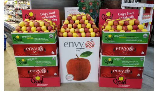
4TH PLACE: Organnons Natural Market - Newtown, PA