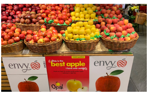
6TH PLACE: Morton Williams Amber - New York, NY