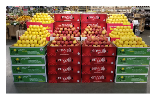
2ND PLACE: Healthy Living Market - Saratoga Springs, NY