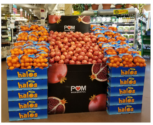
5<sup>TH</sup> place: Brattleboro Food Coop - Brattleboro, VT