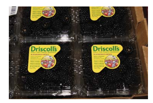
CV BLACKBERRIES & RASPBERRIES

Driscoll's and other shippers are reporting large berry sizing out of Salinas, making mid-May a good time to promote 2 lb. packs.