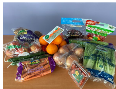
ORGANIC MIXED STAPLES BOX CODE: 224353