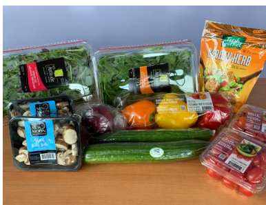
SALAD PLEASER BOX CODE: 224352