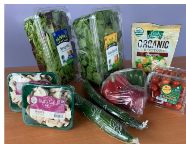
ORGANIC SALAD PLEASER BOX CODE: 224351