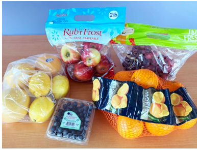
FRUIT MIXED BOX CODE: 224254

Contact your rep or merchandiser to learn how you can launch this program in your store.