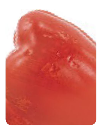
Chill injury can cause pitting.