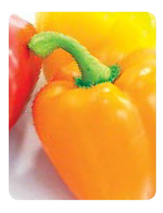
Peppers stored and displayed under proper conditions.