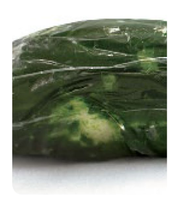
Chill injury can cause decay, water-soaked spots and pitting.