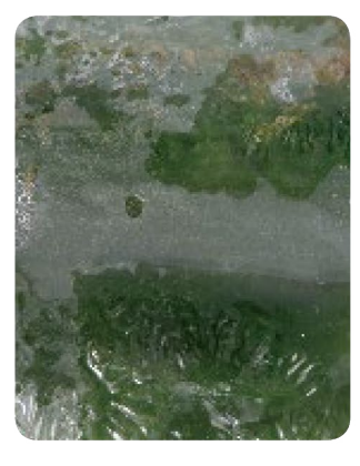
Moisture under plastic wrap can occur from sprayers/ water damage or chill injury and promotes decay.