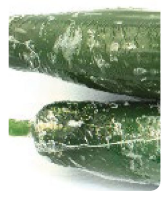
Placing cucumbers under sprayers can cause moisture build-up and softening.