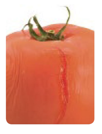
Premature washing increases the likelihood of decay.