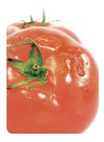
Chill injury can cause decay, softening and loss of flavour.