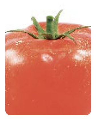
Extended exposure to high temperatures can cause uneven colour development.