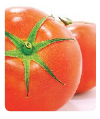
Tomatoes stored and displayed under proper conditions.