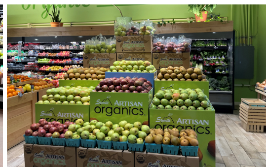
KIMBERTON WHOLE FOODS Collegeville, PA