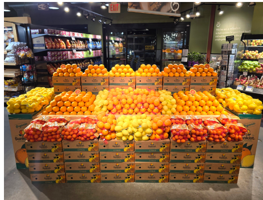
HEALTHY LIVING MARKET South Burlington, VT