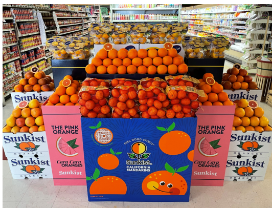
GREENBELT CO-OP SUPERMARKET Greenbelt, MD