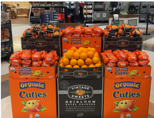
G&E INC. Bethany Beach, DE