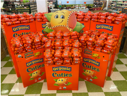
WEAVER MARKETS Denver, PA