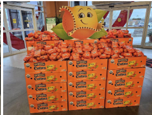
HEALTHY LIVING MARKET Saratoga Springs, NY