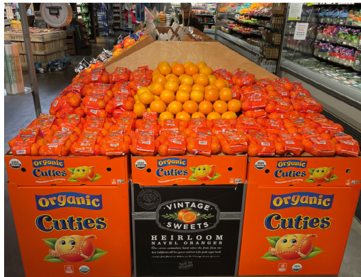
DAWSON'S MARKET Rockville, MD