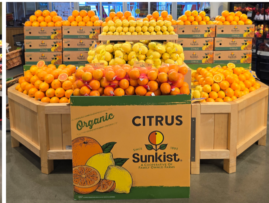
HEALTHY LIVING MARKET Saratoga Springs, NY