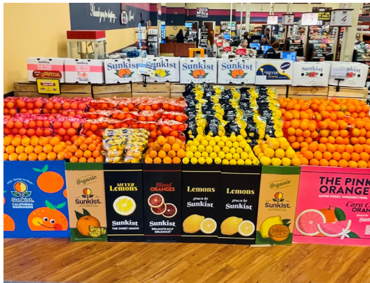
KENNIE'S MARKETS Gettysburg, PA