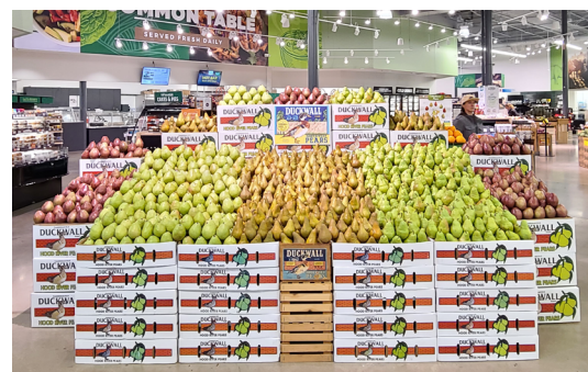
COMMON MARKET 7TH STREET Frederick, MD