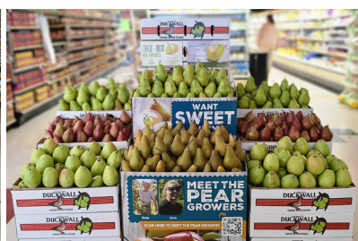
GREENBELT CO-OP SUPERMARKET Greenbelt, MD