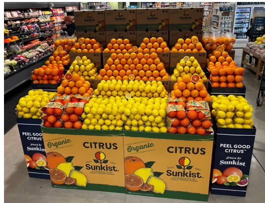
KIMBERTON WHOLE FOODS Wyomissing, PA