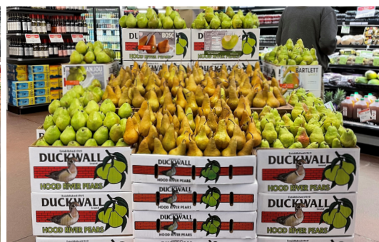
BRATTLEBORO FOOD CO-OP Brattleboro, VT