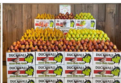
RIVER VALLEY CO-OP Easthampton, MA