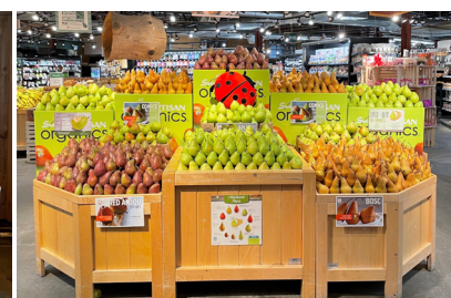
HEALTHY LIVING MARKET South Burlington, VT