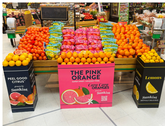
JERRY'S GREAT VALU Red Lion, PA