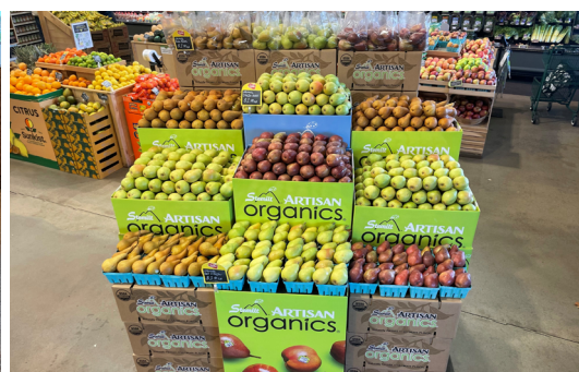
KIMBERTON WHOLE FOODS Ottsville, PA