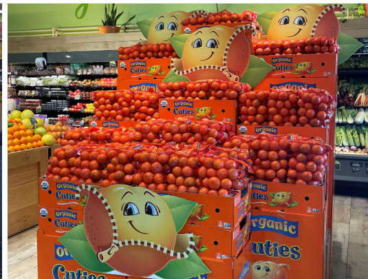
KIMBERTON WHOLE FOODS Collegeville, PA