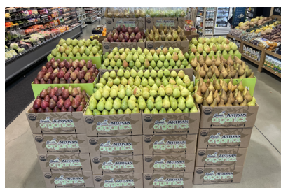
KIMBERTON WHOLE FOODS Wyomissing, PA