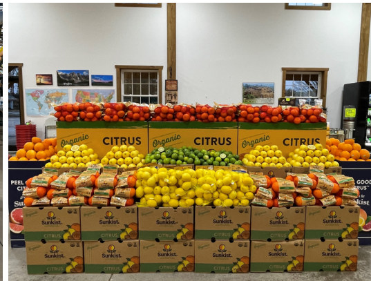
WEAVER'S FARM MARKET Pittsgrove, NJ