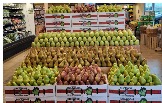
FRIENDLY CITY FOOD CO-OP Harrisonburg, VA