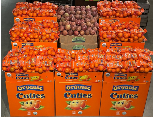
LEG UP FARMERS MARKET York, PA