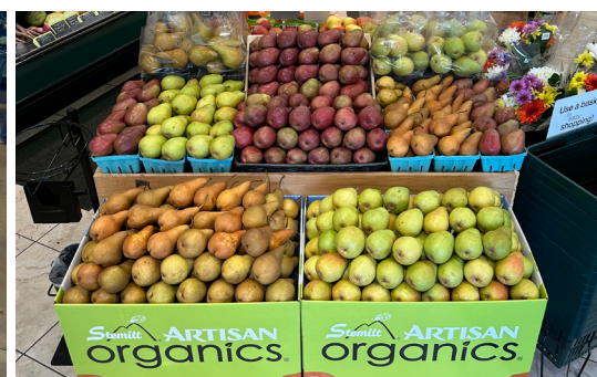
KIMBERTON WHOLE FOODS Douglassville, PA