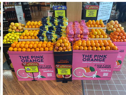
KENNIE'S MARKETS Littlestown, PA