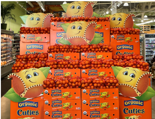
KIMBERTON WHOLE FOODS Wyomissing, PA