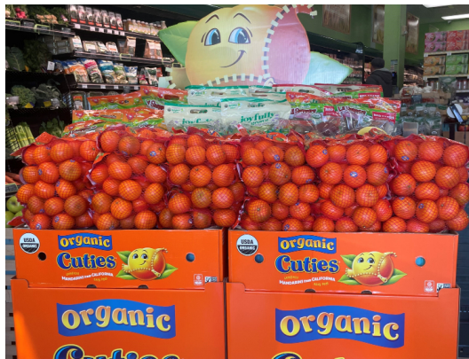
KIMBERTON WHOLE FOODS Douglassville, PA