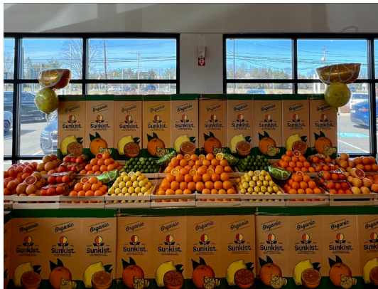
SOULBERRY NATURAL MARKET New Hope, PA