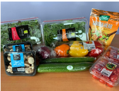
SALAD PLEASER BOX CODE: 224352