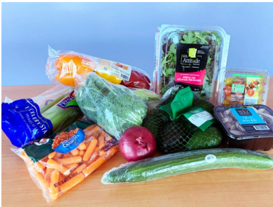
SALAD MIXED BOX CODE: 224255