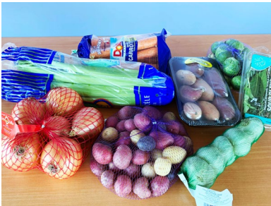
COOKING VEG/SOUP MIXED BOX CODE: 224256