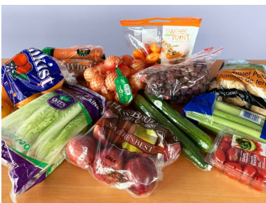
MIXED STAPLES BOX CODE: 224354