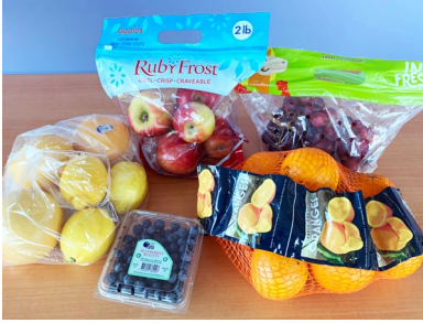
FRUIT MIXED BOX CODE: 224254

Contact your rep or merchandiser to learn how you can launch this program in your store.