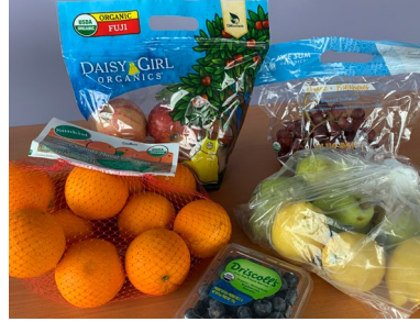
ORGANIC FRUIT MIXED BOX CODE: 224251