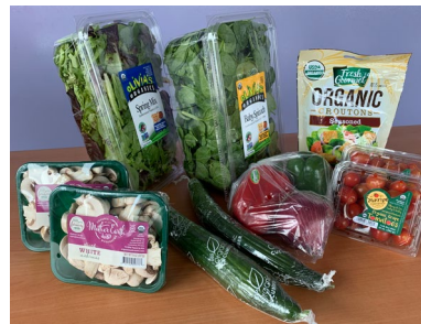
ORGANIC SALAD PLEASER BOX CODE: 224351