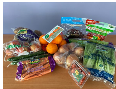
ORGANIC MIXED STAPLES BOX CODE: 224353