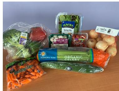
ORGANIC SALAD MIXED BOX CODE: 224252