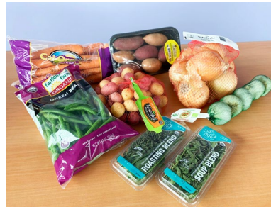
ORGANIC COOKING VEG/SOUP MIXED BOX CODE: 224253