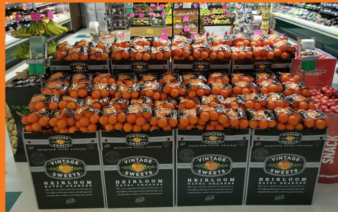
Greenbelt Co-op Supermarket - Greenbelt, MD