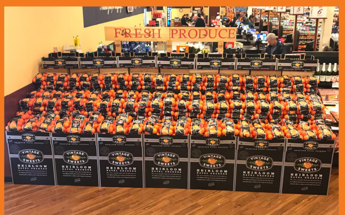
Kennie's Market - Gettysburg, PA