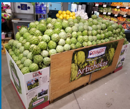
River Valley Co-op - Northampton, MA