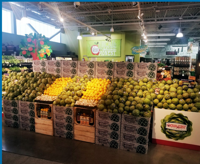
Honest Weight Food Co-op - Albany, NY