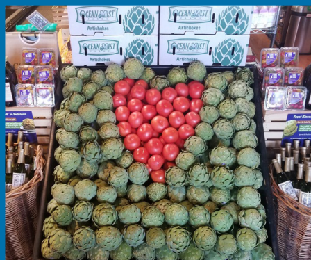
Caravia Fresh Foods - South Abington, PA

Check out some of the other displays below!