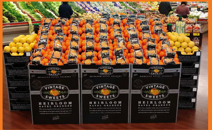
Mussers - Lebanon, PA