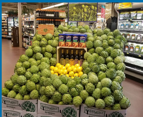
Brattleboro Food Co-op - Brattleboro, VT