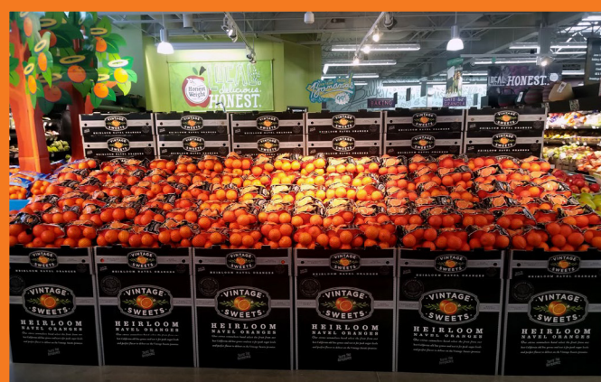
Honest Weight Food Co-op - Albany, NY

From February 11 th to March 1 st we ran our heirloom navel orange display contest in a partnership with Vintage Sweets. We had some incredible entries with fantastic displays. Thank you to everyone who helped participate in this event. Check out the top winners below!