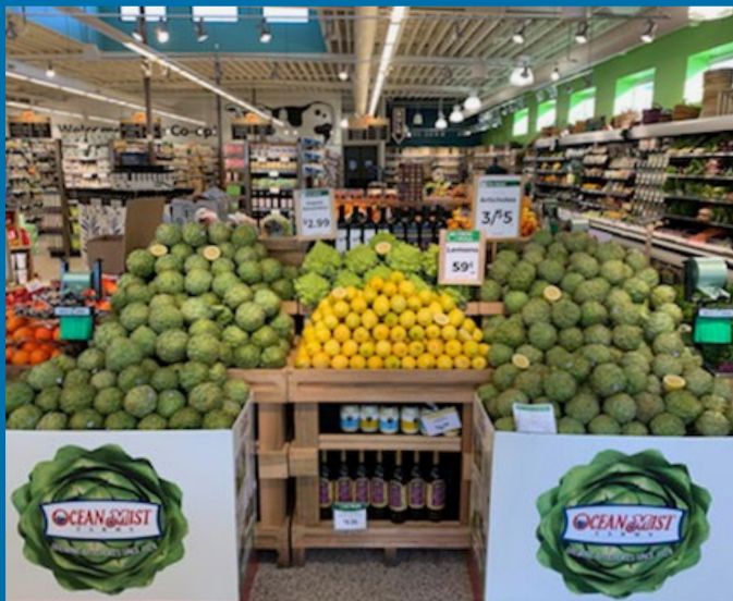
Lexington Co-op - Buffalo, NY

From February 11 th to March 3 rd we ran our jumbo artichoke promotion contest in a partnership with Ocean Mist Farms. We had some incredible entries with fantastic displays. Thank you to everyone who helped participate in this event. Check out the top five winners below!