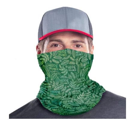
Every entry will receive a Hippie Organics neck gaiter mask!

Talk to your Four Seasons Sales Rep or Merchandiser for Organic Asparagus display tips and ideas!