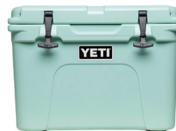
3RD PLACE YETI COOLER