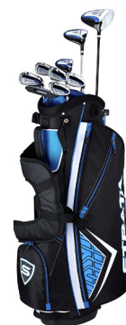
4TH PLACE GOLF CLUBS