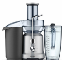
5TH PLACE BREVILLE JUICER