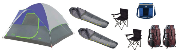
BEST ORGANIC DISPLAY 1ST PLACE CAMPING PACKAGE